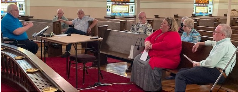
Meeting after May 22's Worship

Please remember the safety of all the workers!