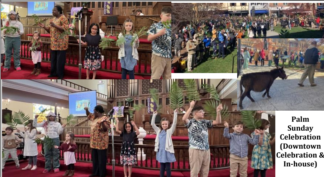
Palm Sunday Celebration (Downtown Celebration & In-house)