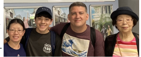
Summer 2023(Our last time together)