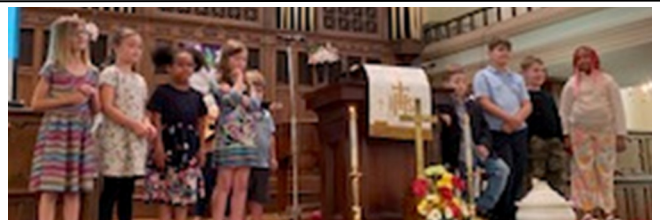
Kids did an awesome job singing on Mother's Day!